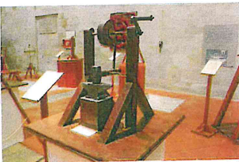
MARTELLO A CAMME