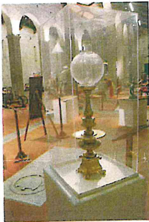
LANTERNA O FONTANA cm 80 x 80 x 2,15